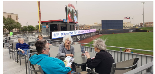
Wind gusts up to 70 mph!