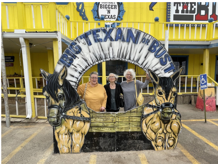
What would Amarillo be with The Big Texan Steakhouse?