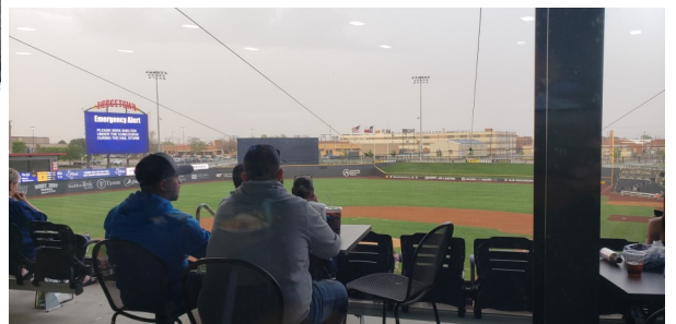
Rain and hail. The only things we didn't have were fire, famine and pestilence....