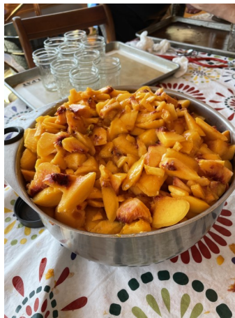
Peeling a gazillion peaches.