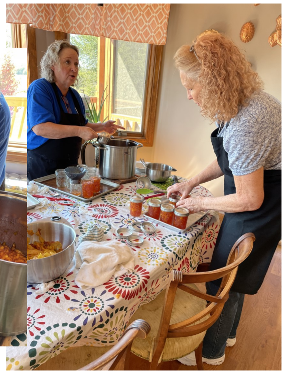
Closing 'em up.