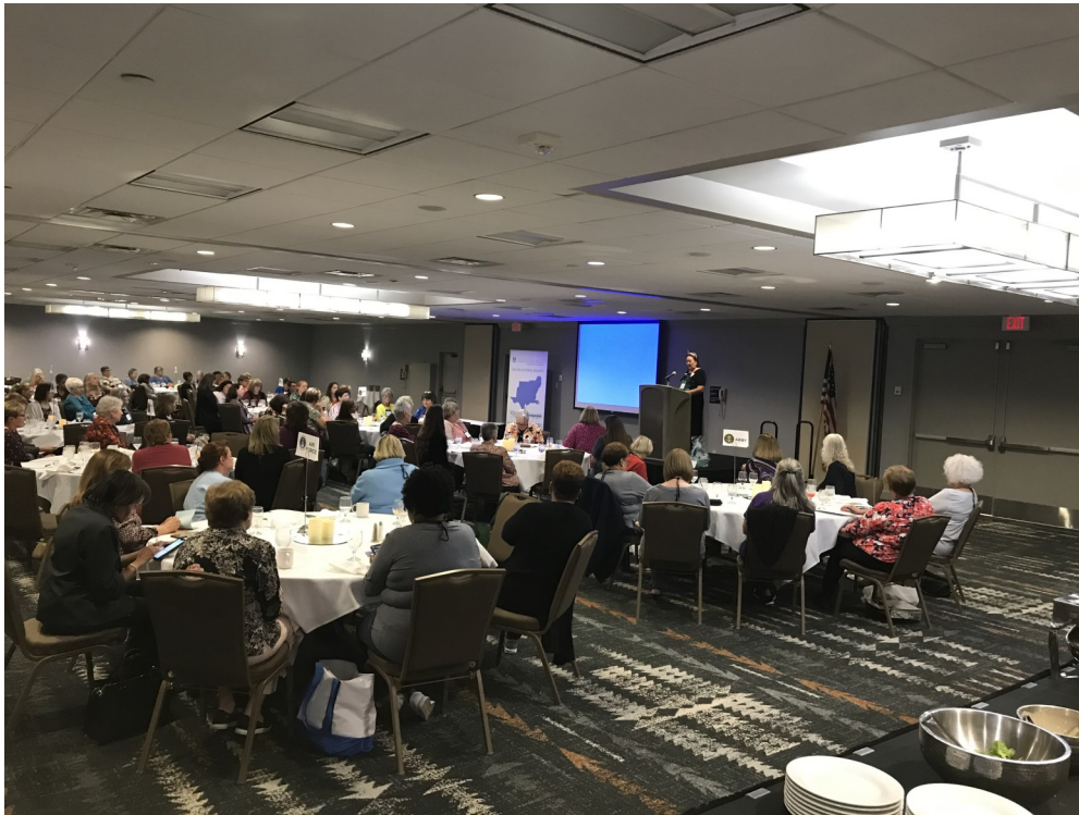
Governor Angel presiding over opening ceremonies Friday night.