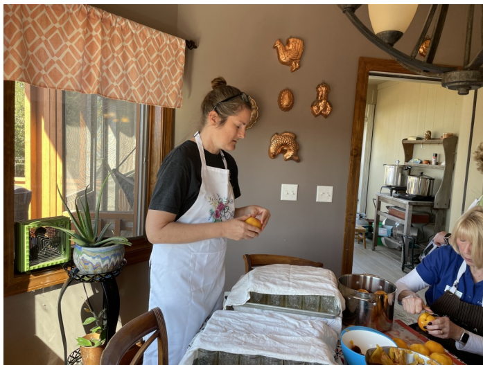
It is a fun activity.