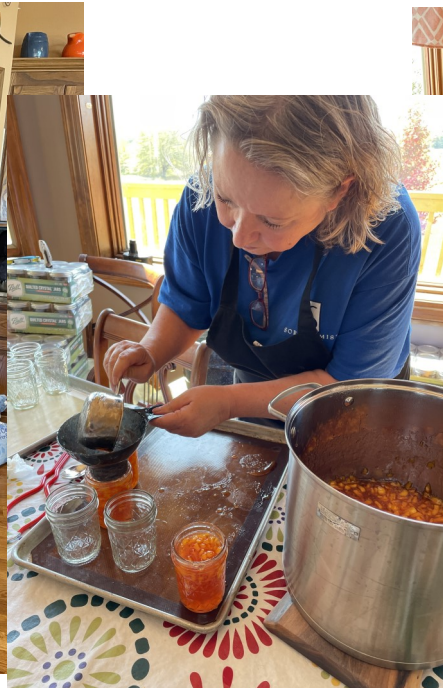
Filling the jars.