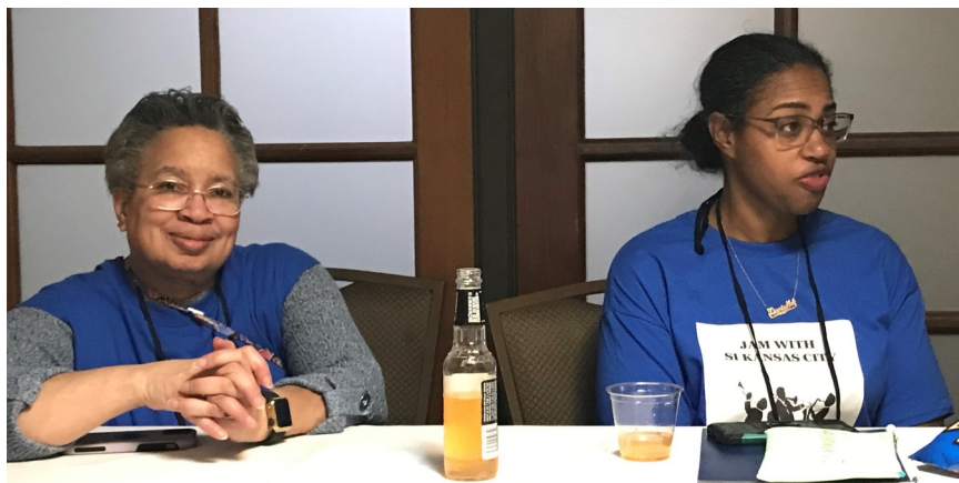
Enjoying our speaker.