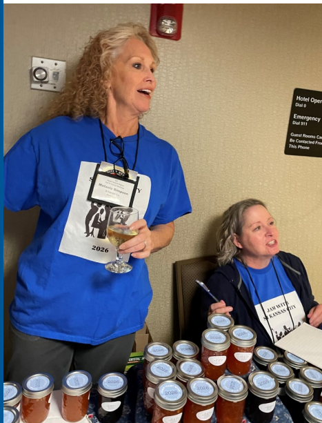
Selling that JAM!