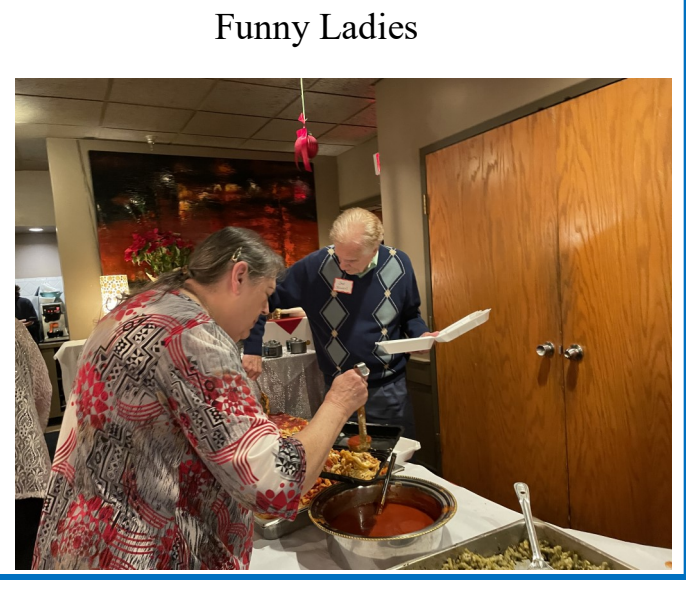
Taking Home the Leftovers...