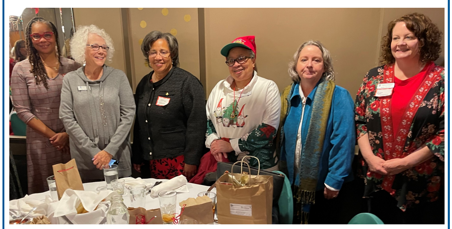
Some of our hosts.