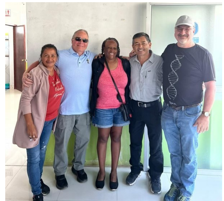
Some of her compadres.