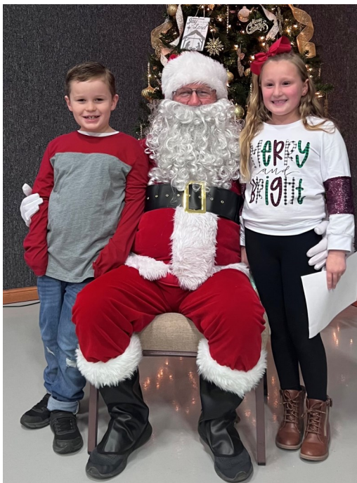
Good Little Munchkins...