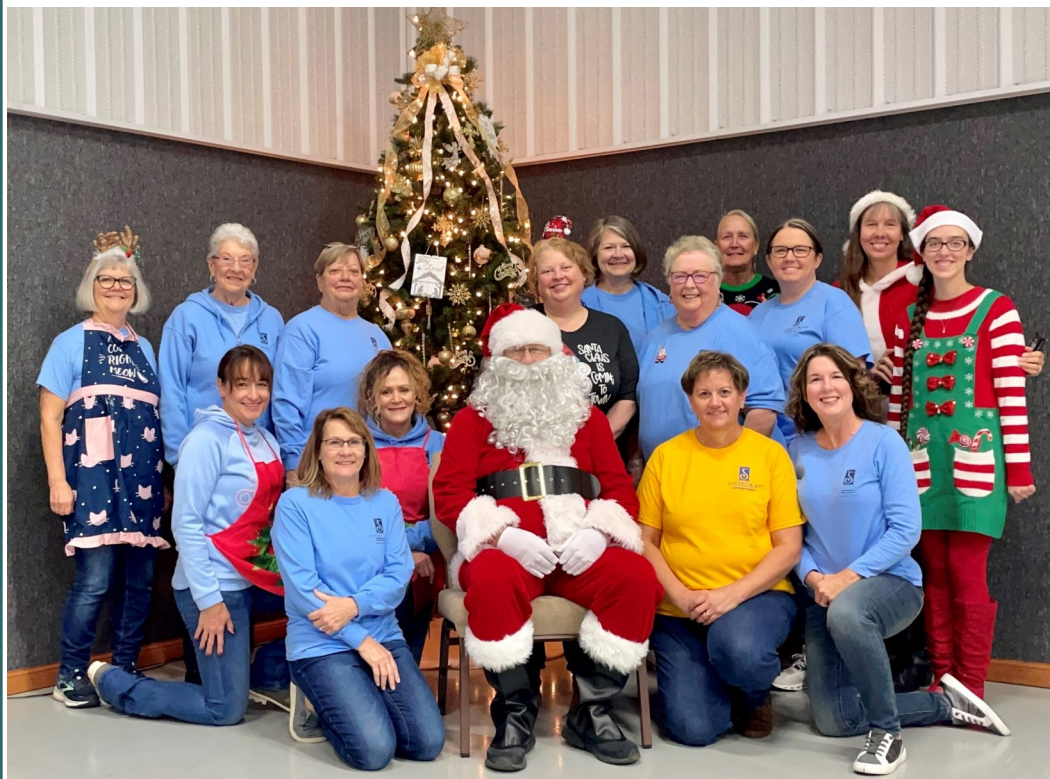
SI Vandalia celebrated Christmas with Santa...