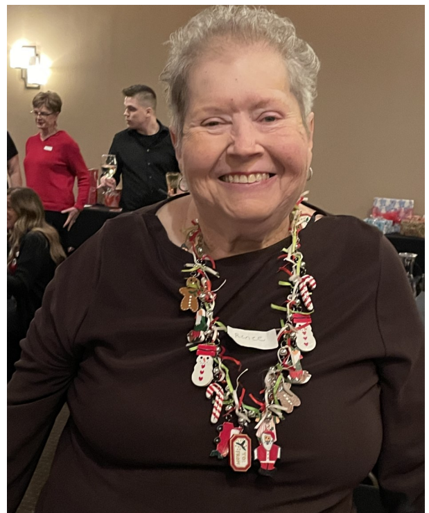
The best necklace of the evening...