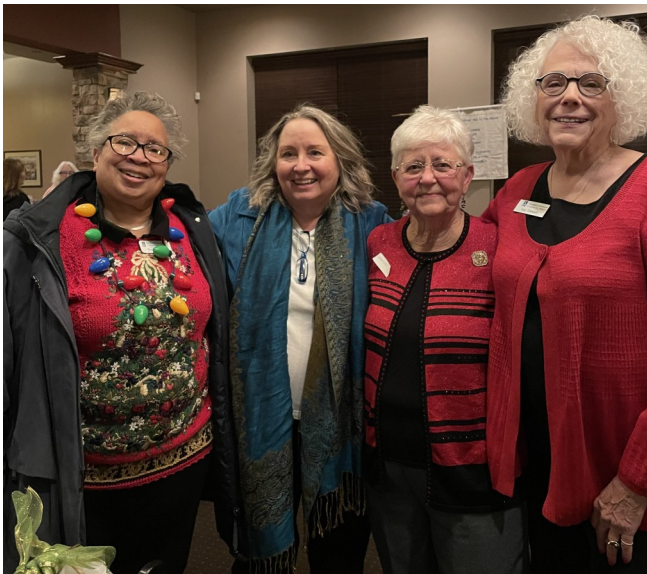
SI Kansas City was represented...