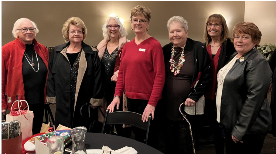
The SI St. Joseph contingent...

In December, SIKC took part in our annual combined club Holiday Party. We joined with SI Liberty (the host club), SI St. Joseph, and SI Kansas City Northland for an evening of good food, fun and holiday spirit. This is one of our favorite social events of the year. So good to see old friends and celebrate the holidays.