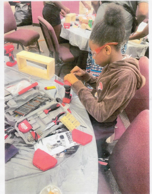
These young women are having a wonderful time learning how to use tools to repair small appliances.

Dec. 19, 2023 Kay - Thank you so much for your generous donation to TZone. Your gift allowed us the opportunity to train many young girls in unconventional career choices and how to use their tool kits. Please see attached for a glimpse of what your gift accomplished in 2023. Thank you. Jackie