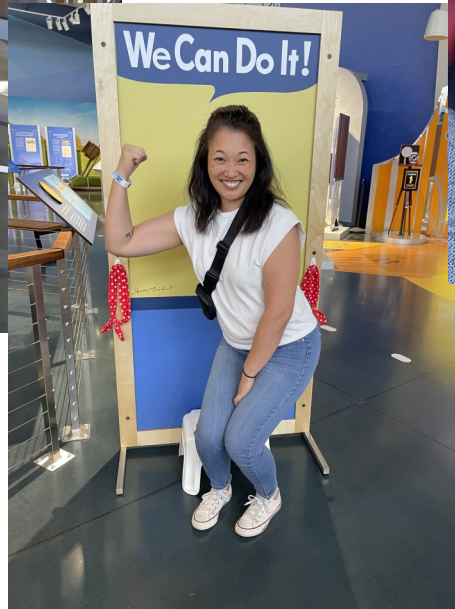
She CAN do it!