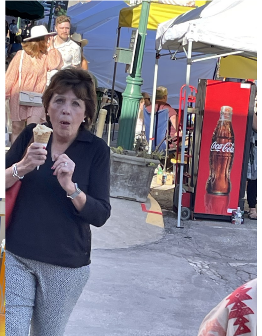
Of course, we stopped in Weston for homemade ice cream.