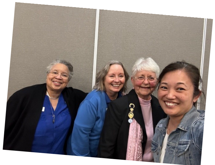
SIKC was well represented...