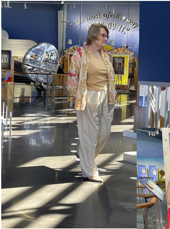
Exploring the museum.