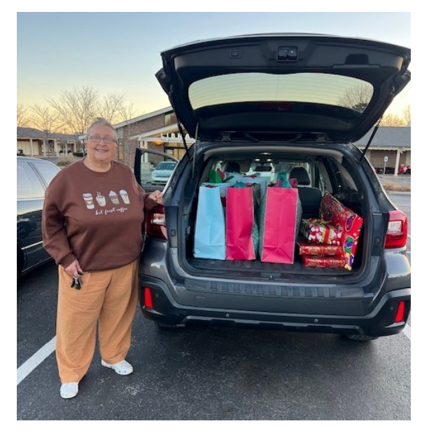
Meeting at Red Bridge Library