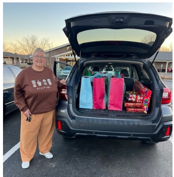
Meeting at Red Bridge Library