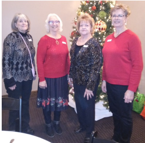
SI St. Joseph

SI Kansas City Northland took on the hosting duties for our annual combined club Holiday Party this year. They chose Conrad's in Liberty as it is a central location for all the clubs. SI St. Joseph always makes the hour long drive down I-29 to join us. It is always so much fun to see old friends and get caught up.